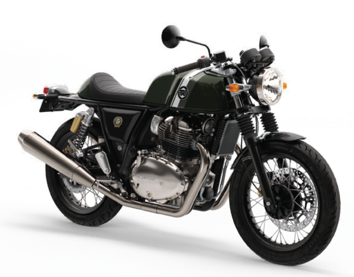
British Racing Green